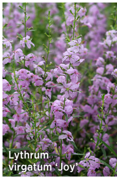
Lythrum virgatum 'Joy'