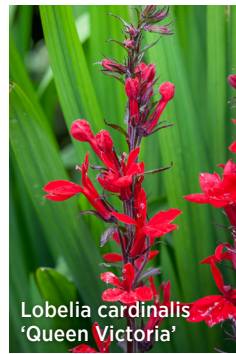
Lobelia cardinalis 'Queen Victoria'